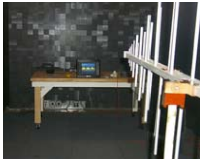
Radiated immunity test chamber (80 MHz - 1GHz)

Chomerics is the first choice in EMI shielding and thermal management solutions for telecommunications, information technology, medical devices, automotive, military, commercial and consumer electronics. We offer full service compliance testing to meet emissions, immunity, susceptibility and safety requirements. We can immediately solve virtually any EMI/EMC and safety problem that testing may reveal, and recommend cost-effective solutions to reduce your product's time to market.