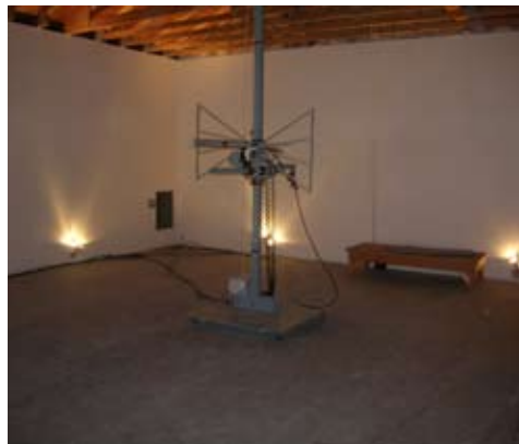
Open field test site (3-10M)